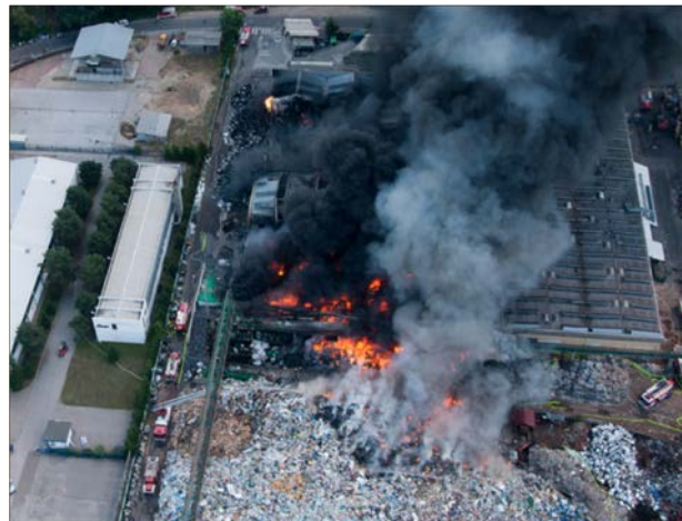
NATURAL PERILS AND DAMAGE