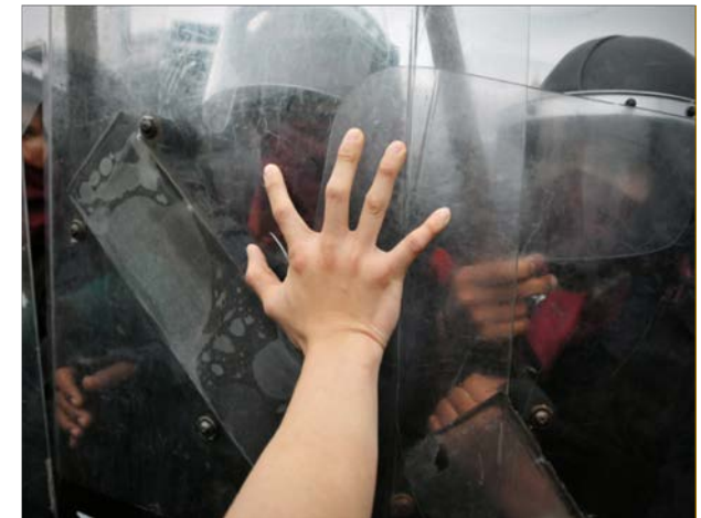
POLITICAL AND BUSINESS